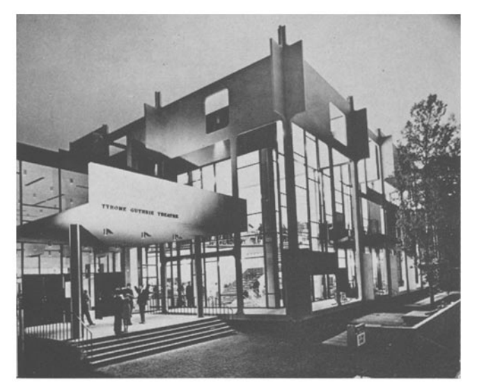
Tyrone Guthrie Theatre

The Tyrone Guthrie Theatre "sought a city and got two." The 2\frac{1}{4} million dollar glass wall façade presents an exciting and colorful show-case. The thrust stage allows audience-actor intimacy. There are monthly backstage tours.